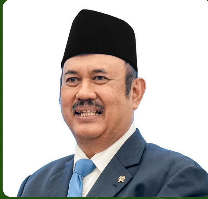
Prof. Dr. Ir. Rachmat Pambudy, M.S.*

Minister of National Development Planning / Head of Bappenas, Republic of Indonesia